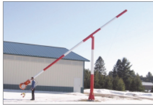
Beacon Tipdown Pole